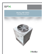
Marley MD Cooling Tower

SPX Cooling Technologies offers a full line of industry leading products – with exceptional support and innovation designed to help you get the most out of your cooling process. Take a look at these other Marley products at spxcooling.com .