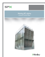
Marley NC Alpha Splash-Fill Cooling Tower