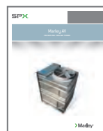
Marley AV Series Cooling Tower