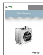
Marley Aquatower® Cooling Tower