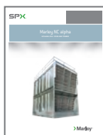
NC Alpha Splash-Fill Cooling Tower