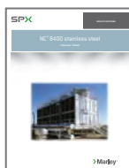
NC Steel Specifications