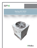
Marley MD Cooling Tower

SPX Cooling Technologies offers a full line of industry leading products – with exceptional support and innovation designed to help you get the most out of your cooling process. Take a look at these other Marley products at spxcooling.com .