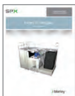
NC Fiberglass Engineering Data and Specifications

For further information about the NC Cooling Tower – including engineering schematics, data, layout requirements and more – download these NC publications and others at spxcooling.com .