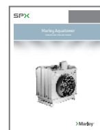
Marley Aquatower® Cooling Tower