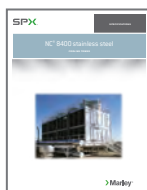
NC Steel Engineering Data