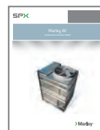
Marley AV Cooling Tower